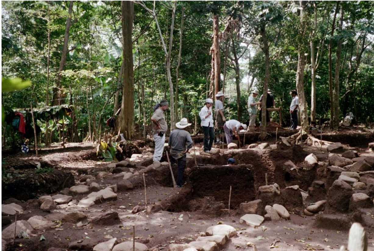
Pre-Classic Maya Archeology site; Chocolá, 2004